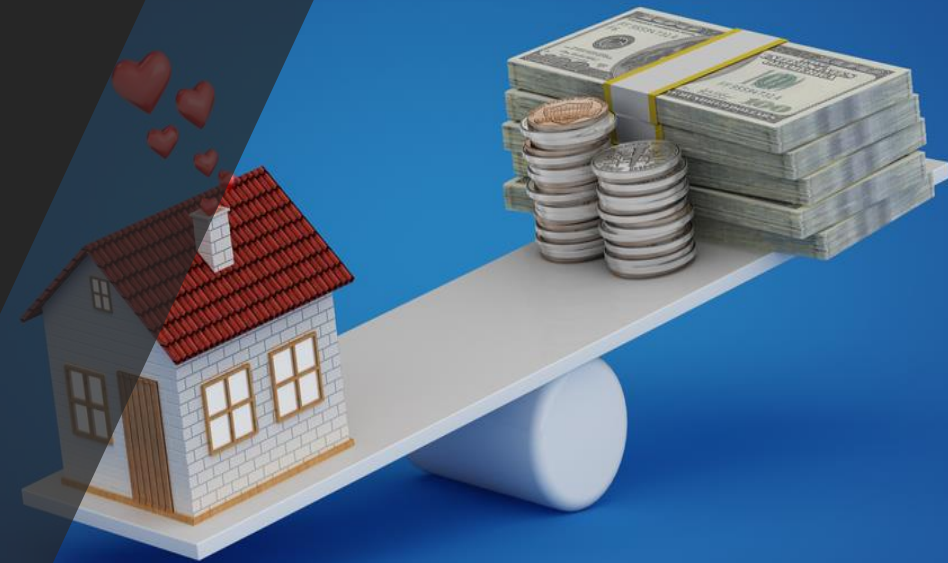
Consumer Loans// Business Loans